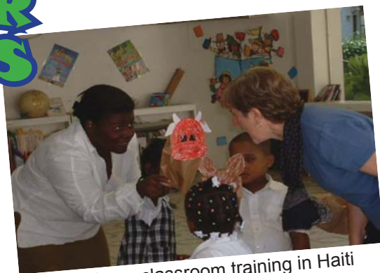
Hands-on classroom training in Haiti

Educators are teachers, administrators, children's workers, pastors, missionaries, etc.