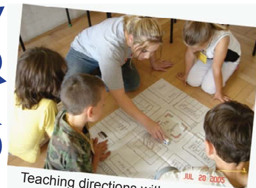
Teaching directions with car & maps!

English camps & trainings are interactive and communication-based and include drama, art, music, culture cafes & sports.