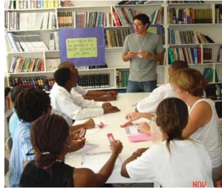
Teacher training seminar in Haiti