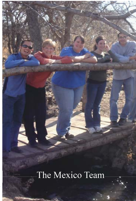
The Mexico Team